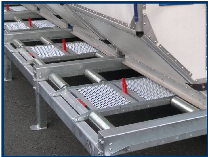
Cargo-rollers and manually operated ULD stops.