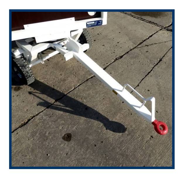
Manual self-locking E-type spring-loaded tow-hitch. Rockinger tow-hitch available.