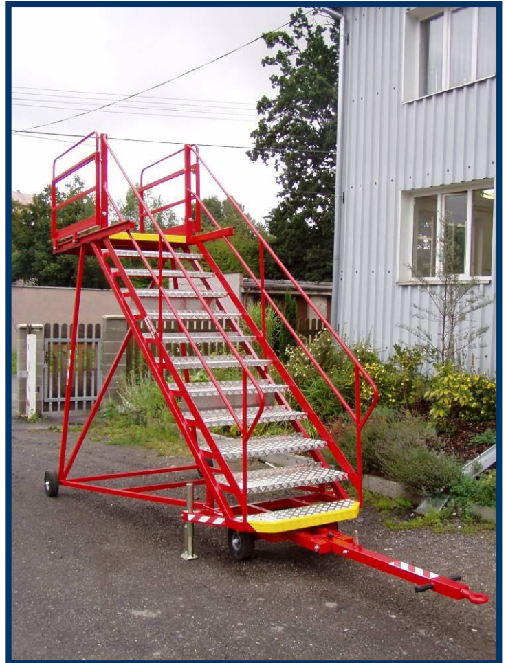
Colour shade to be defined as per RAL colour chart.