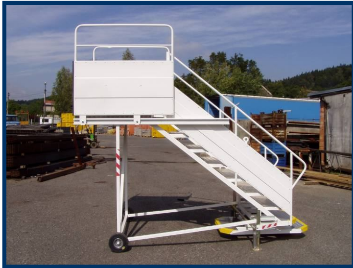
Optional versions with sliding platform handrails.